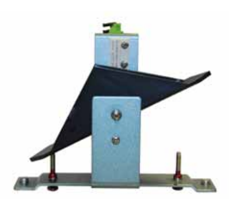
RG1 tipping bucket mechanism