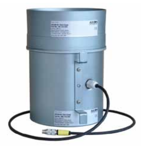
RG1 Rain Gauge Body, 200cm<sup>2</sup> version